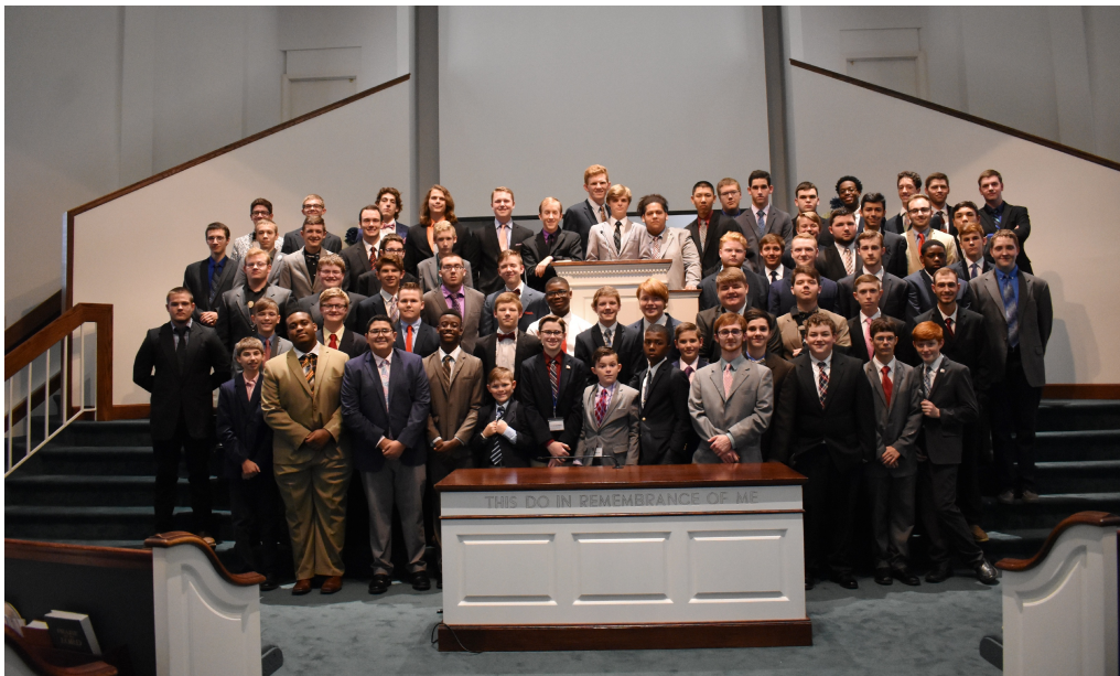
The Guys Who Attended Foundations 2019